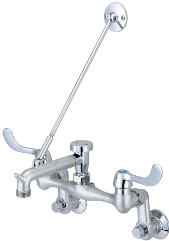
CENTRAL BRASS WALL MOUNT SERVICE SINK MIXER CHROME WELS O STAR 37 L/MIN