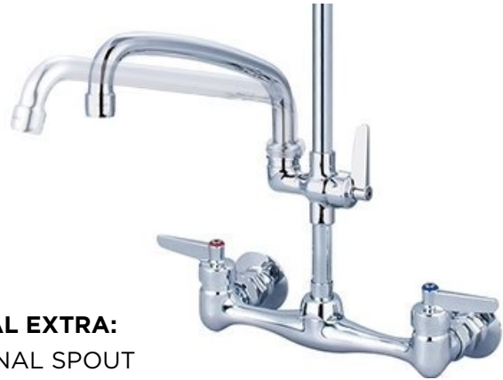
OPTIONAL EXTRA: ADDITIONAL SPOUT LENGTHS AVAILABLE